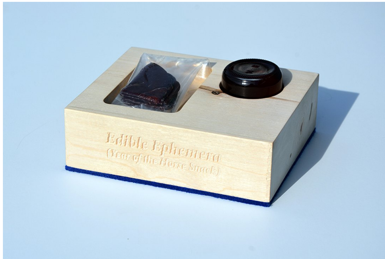
Edible Ephemera (Year of the Horse Snack) 2014